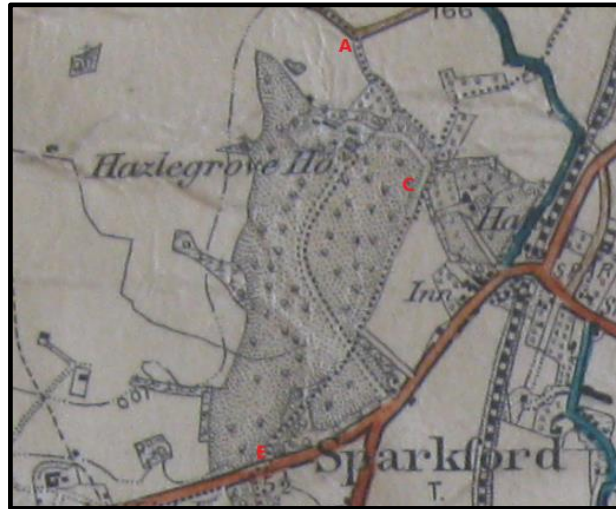
1929 Handover map, red letters added for reference