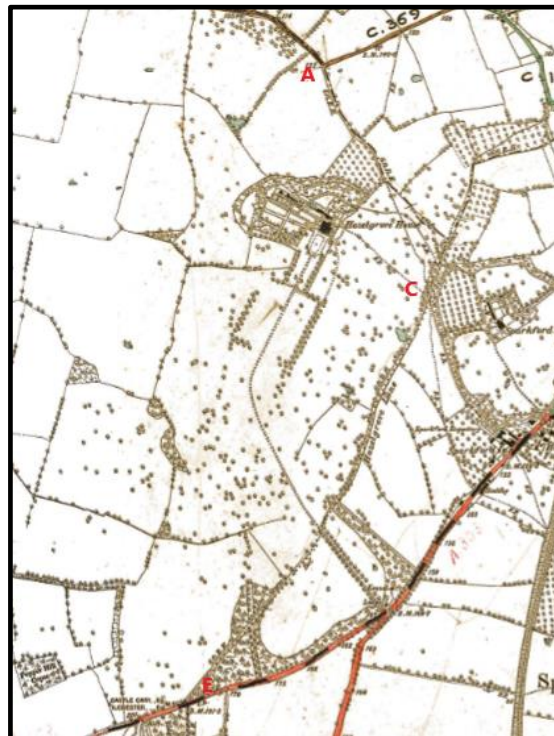
1930s road records, red letters added for reference