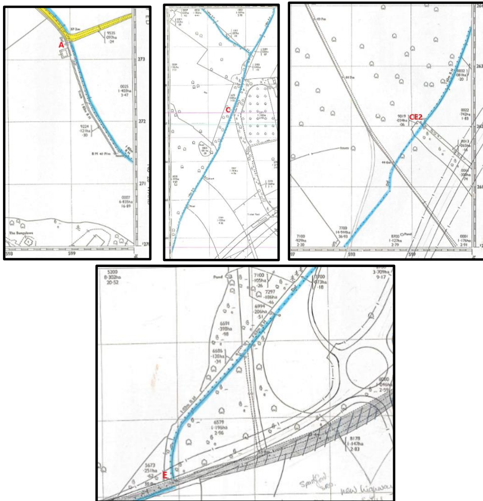
1970s road records, red letters added for reference